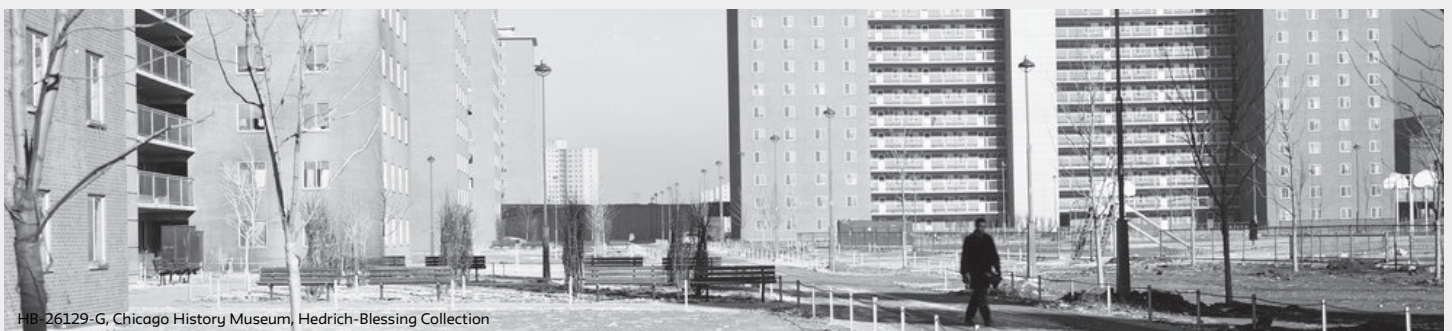
HB 26129-G, Chicago History Museum, Hedrich-Blessing Collection

Note: The difference in the percentage of noted groups as compared with the percentage of White families is statistically significant at the ***99%, **95%, *90% level.