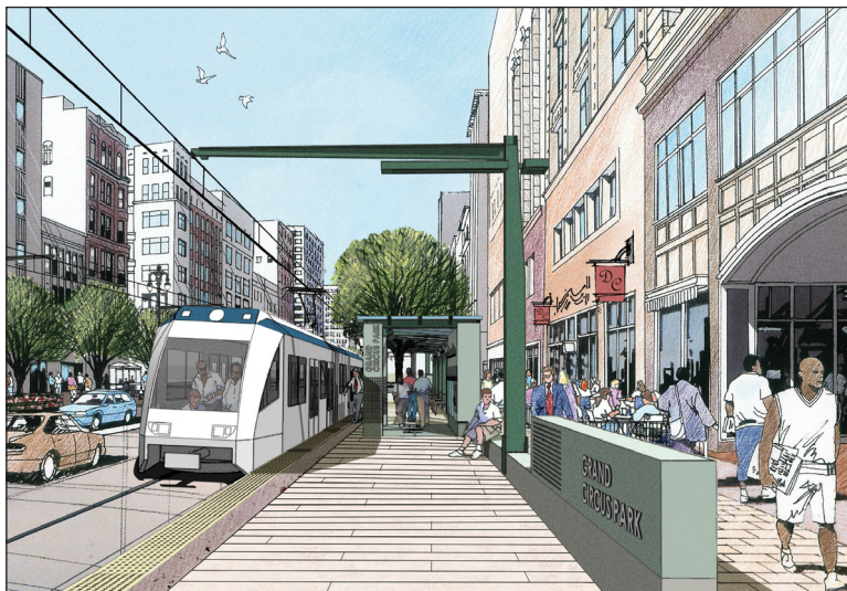
An artist’s conception of a stop on the M-1 RAIL system.

A high-quality system of mass transit has long been a missing link in Detroit. In 2008, driven by recognition that density and transit-oriented development are sound principles for sustainable urban growth, a partnership was established with unprecedented private sector financial commitments of nearly $100 million. The goals for the 3.4 mile M-1 RAIL line serving Detroit’s lower Woodward corridor are three-fold: to stimulate development of a larger, intermodal system;