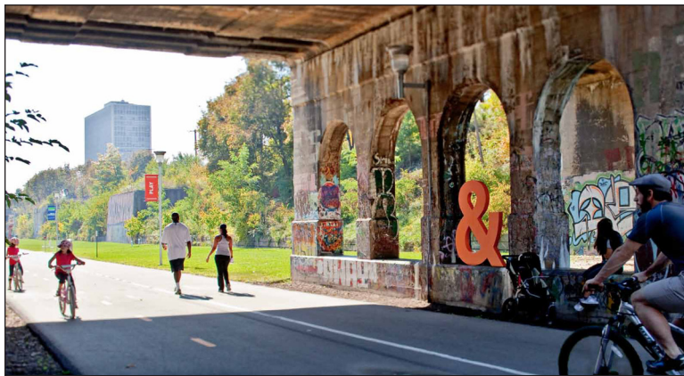
The Dequindre Cut greenway links the Detroit River to Eastern Market and other core districts.

we have at present. It proposes expanding on recent philanthropic efforts to create a network of bike and walking trails in Detroit, most notably the three-mile-long Detroit RiverWalk and the