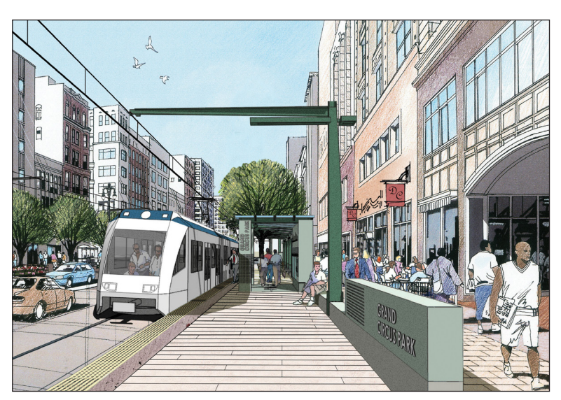
An artist's conception of a stop on the M-1 RAIL system.

A high-quality system of mass transit has long been a missing link in Detroit. In 2008, driven by recognition that density and transit-oriented development are sound principles for sustainable urban growth, a partnership was established with unprecedented private sector financial commitments of nearly $100 million. The goals for the 3.4 mile M-1 RAIL line serving Detroit's lower Woodward corridor are three-fold: to stimulate development of a larger, intermodal system;