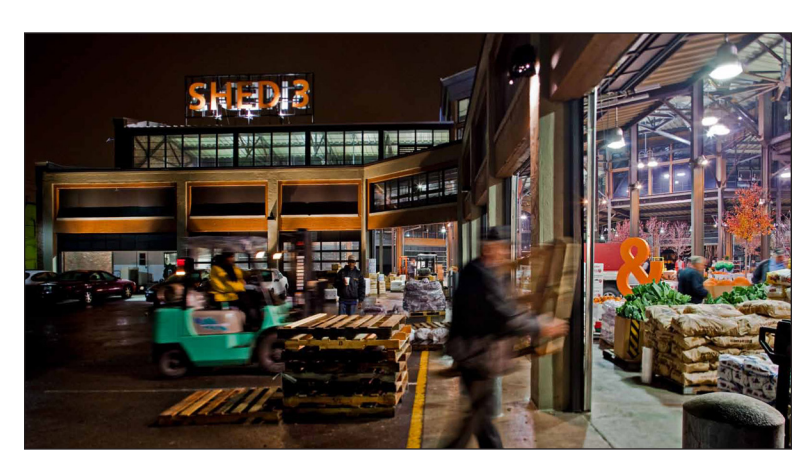
Eastern Market has undergone not only physical restoration, but also transformation into a hub for connecting Detroiters to fresh, locally grown food.

Efforts to improve Detroit's 110-year-old <u>Eastern Market</u>, restore its historically significant farmer and vendor sheds, and improve its management came to fruition in the mid-2000s. It is the largest outdoor farmers' market in the U.S. and the only one that combines wholesale, retail, meat-packing, farm-grown produce from the surrounding area, value-added food industries and community gardens in one location. Since the transformation began, the market's leaders