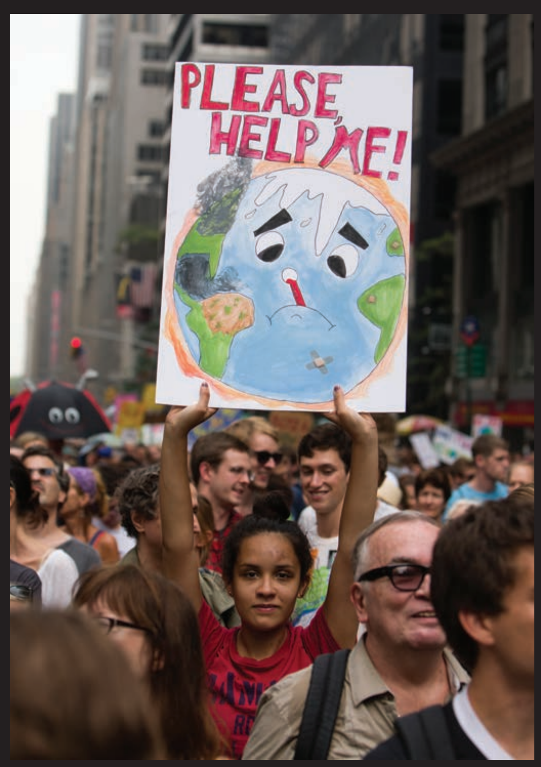
A young demonstrator at the People's Climate March, which drew more than 300,000 to New York City on September 21, 2014.