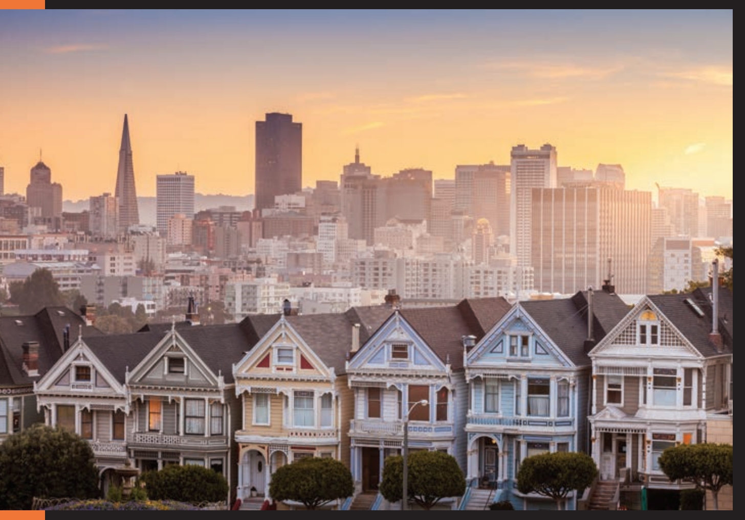
San Francisco at Alamo Square.

Cities are complex adaptive systems, and building urban resilience calls for a holistic, integrated approach.