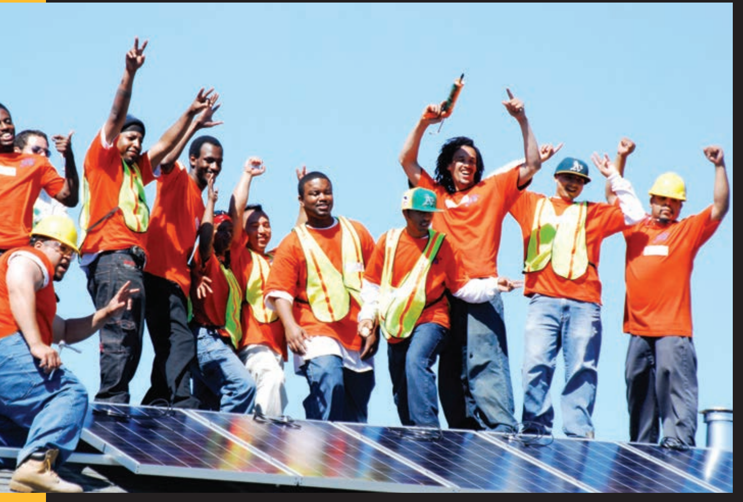
Job trainees get hands-on experience installing a solar electric system for a low-income homeowner in Richmond, CA.

We define urban resilience as the capacity of a community to anticipate, plan for, and mitigate the risks—and seize the opportunities—associated with environmental and social change.