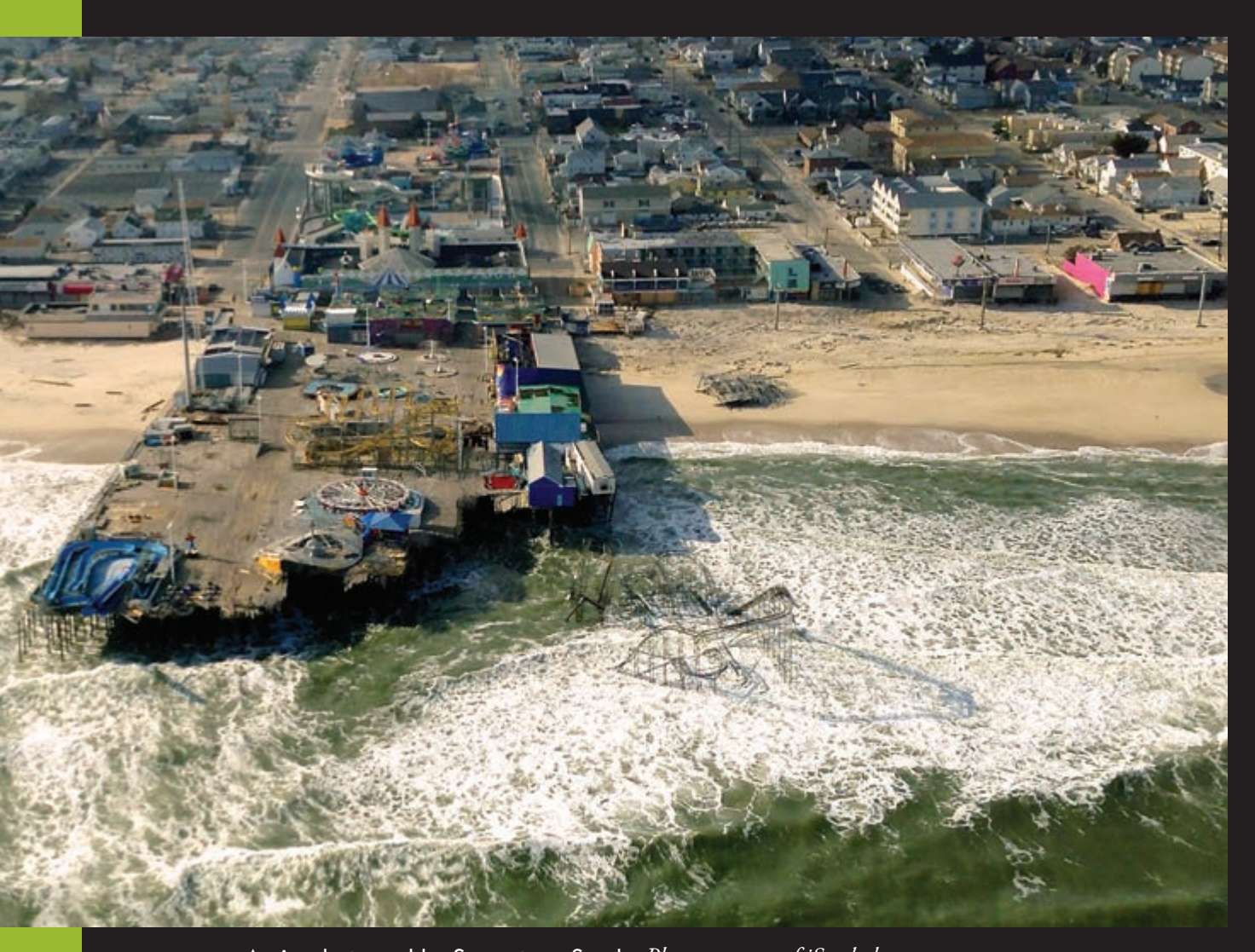
A pier destroyed by Superstorm Sandy.

In a world of rising inequality, risks and opportunities are not equally shared.