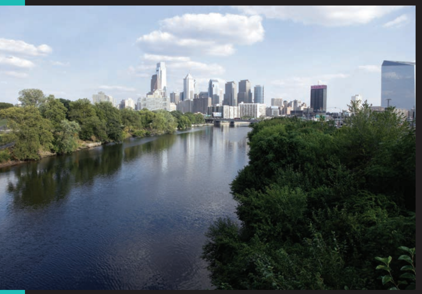
The Philadelphia Water Department has improved water quality in the Schuylkill River and reduced flooding with an emphasis on 'green' infrastructure.

Urban resilience is shaped by a broad array of factors, including social systems; the health and integrity of ecosystems; and the nature of the built environment.