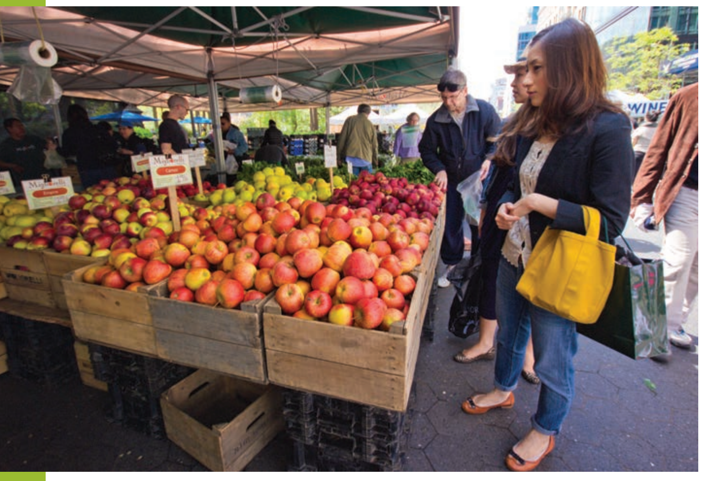
A woman shops for fresh produce at Union Square Greenmarket in New York City, where regional farmers, fishermen, and bakers sell their products.

Florida's Metropole project. With a better understanding of the risks they faced, the community elected to increase taxes in order to lift buildings above the flood zone.<sup>34</sup>