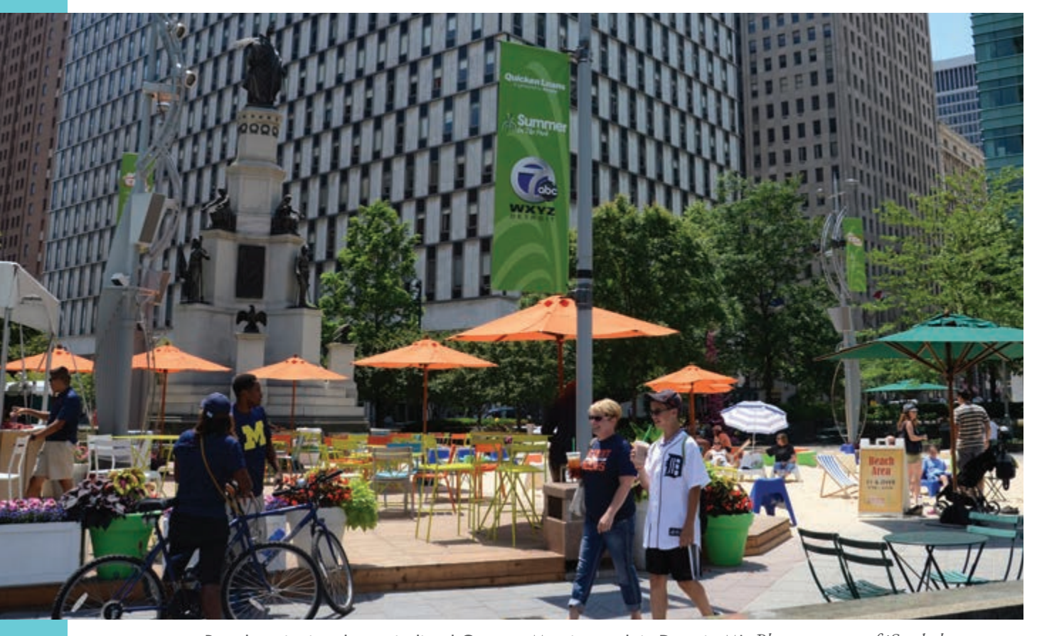
People enjoying the revitalized Campus Martius park in Detroit, MI.