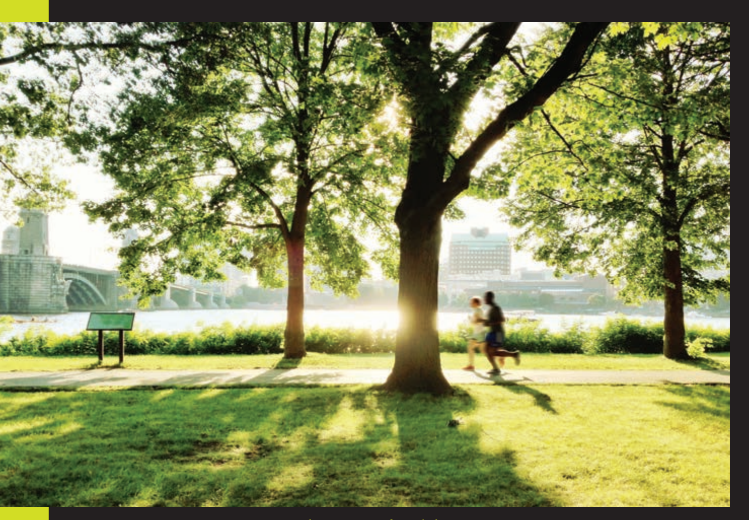
\textbf{Runners in a Boston park.} \ \textit{Photo courtesy of iStockphoto.com}.