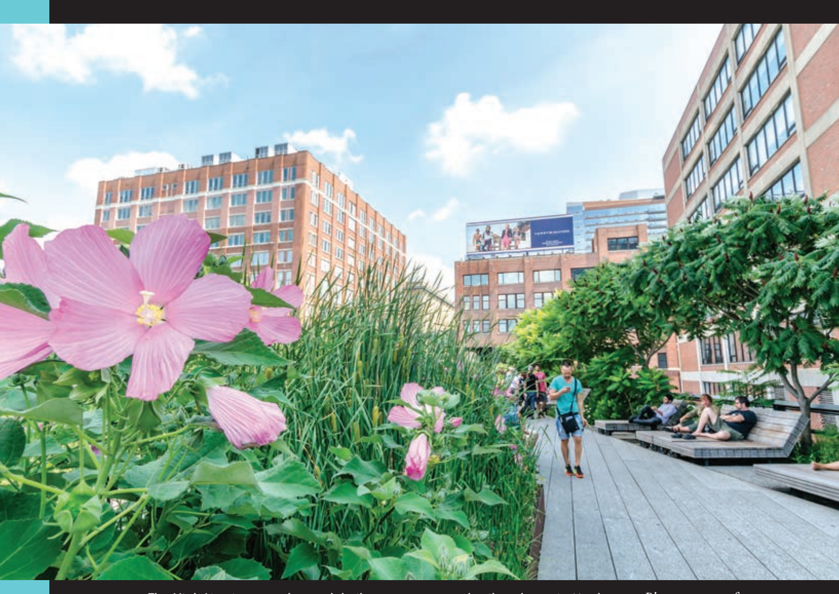
The High Line is a popular park built on a repurposed railroad spur in Manhattan.

The need for resilience could spark transformative changes in American cities.