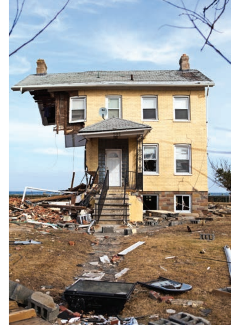
This waterfront home in Union Beach, NJ was destroyed by Superstorm Sandy.

At the same time, DRR—like other perspectives on resilience—has its limitations. For example, DRR practice has been criticized for paying insufficient attention to the underlying causes of vulnerability. 65 And as DRR is largely focused on discrete hazards, such as hurricanes or earthquakes, it may be less well-suited to the long-term changes wrought by climate change, or to problems that span multiple sectors—such as the 2011 tsunami/nuclear disaster that devastated Japan. 66