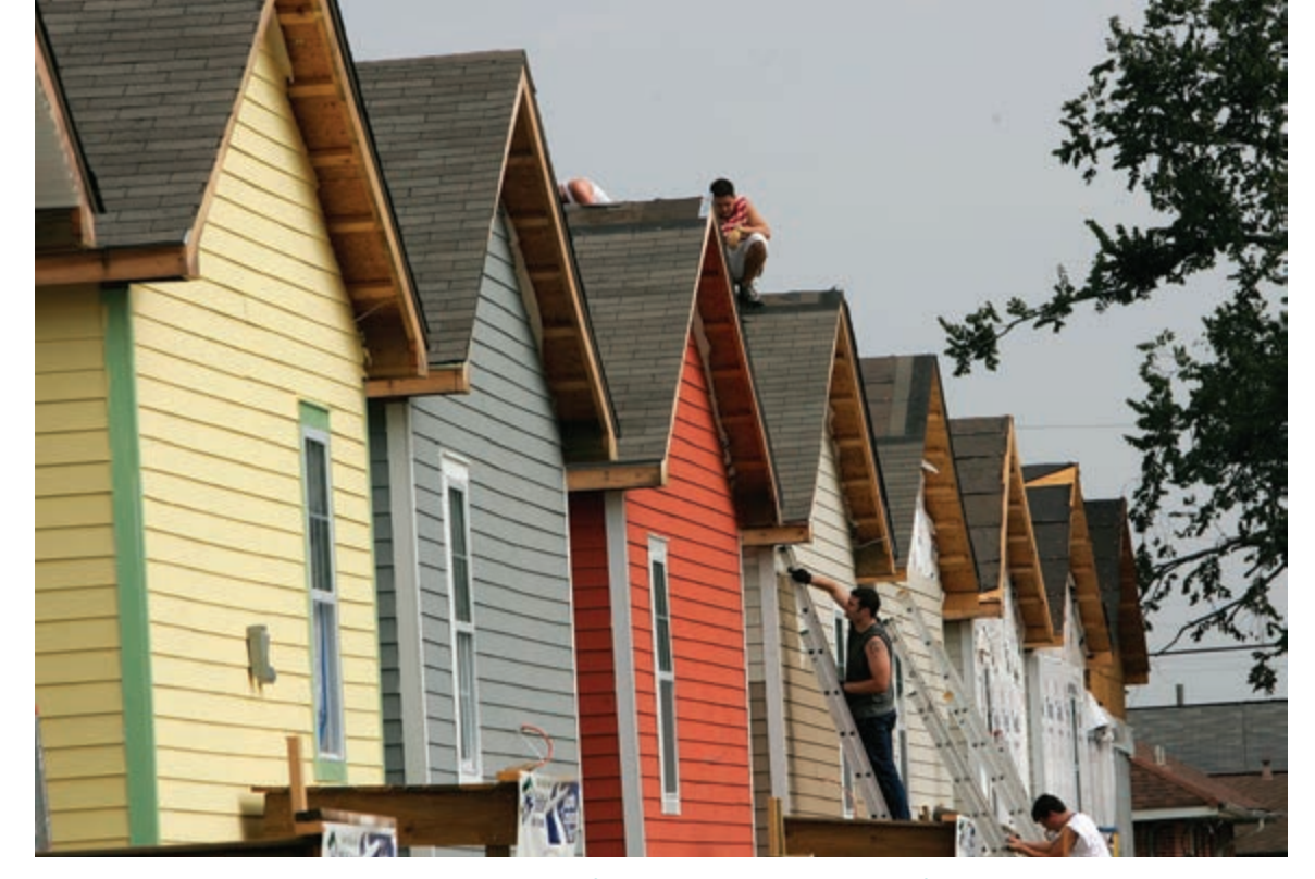
Volunteer construction workers with Habitat for Humanity build homes for displaced musicians in the Upper Ninth Ward of New Orleans, Louisiana.

Ecological resilience thinking is rooted in systems theory, which holds that nothing exists in isolation. While the prevailing Enlightenment worldview reduces systems to their component parts, systems thinkers endeavor to comprehend the integrated whole.<sup>44</sup> Resilience thinkers see ecosystems and human society as complex adaptive systems (CAS): they are complex in that they are diverse and composed of multiple, interconnected elements; they are adaptive in that they have the capacity to change and self-organize.