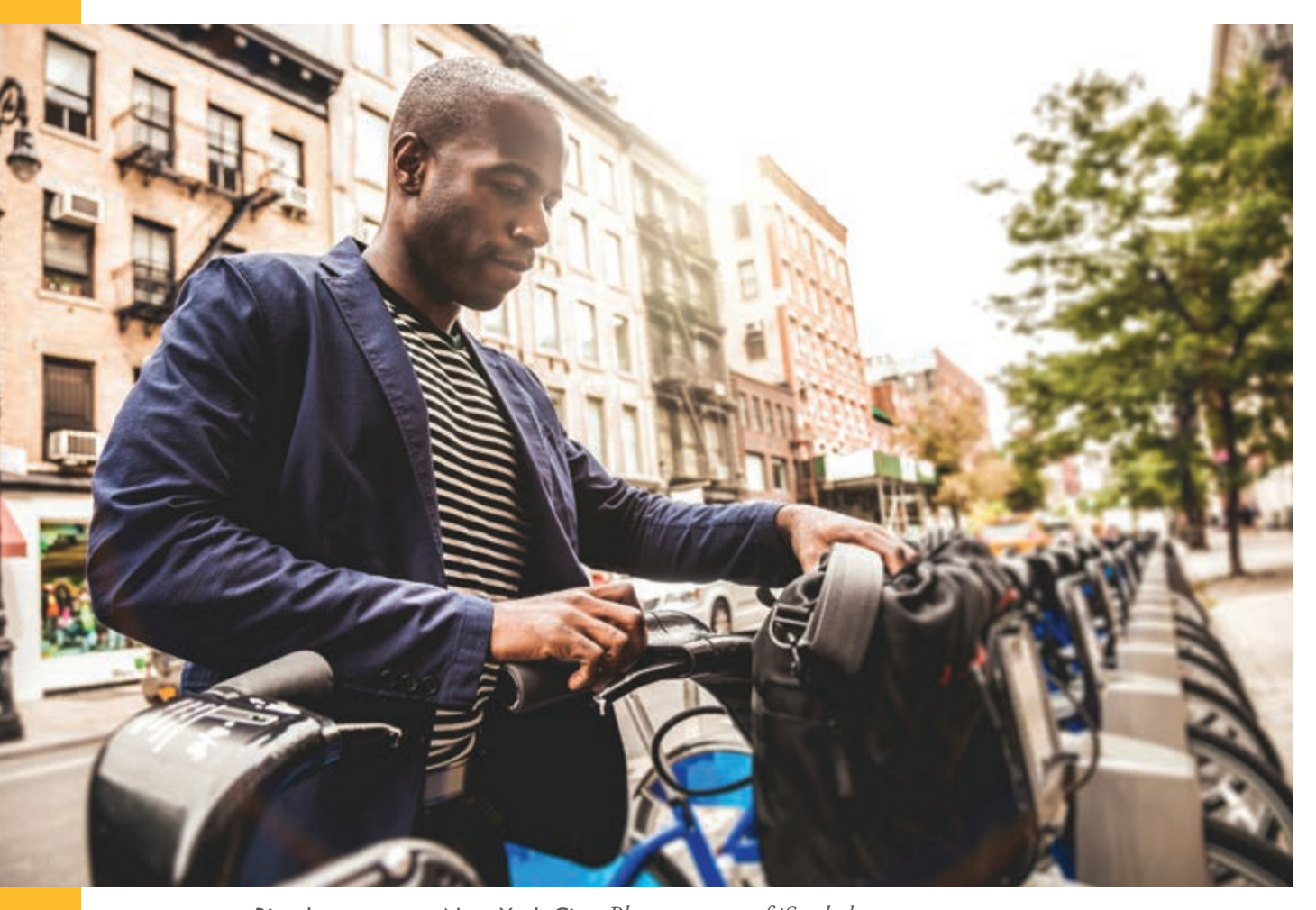
Bicycle commuter, New York City.

Resilience requires a holistic view: focusing myopically on the system at a single scale, or managing for a single outcome, is likely to yield surprises from unanticipated feedbacks. So, managing resilient cities begins with an understanding of urban systems and their functions at many scales, from many perspectives. But, given the extraordinary complexity of cities, it also calls for a certain amount of humility; an admission of what is unknown—and unknowable.<sup>72</sup>