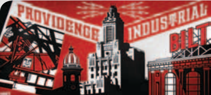
A hub for creative activity and a model for downtown revitalization, the community-based arts organization AS220 in Providence, R.I., provides support and opportunities for artists, operates art-production facilities and gallery space, and engages at-risk youth through art classes, workshops, and mentoring. This mural, designed by acclaimed artist Shepard Fairey, is an AS220 commission.